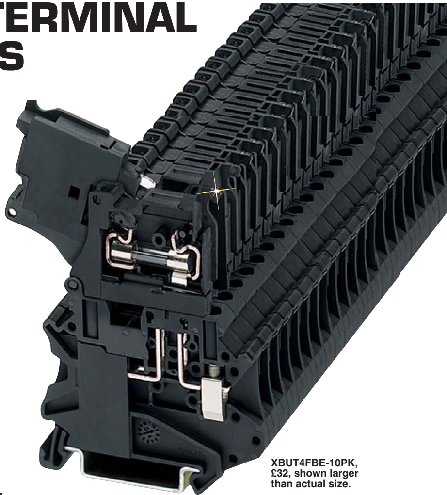
XBUT4FBE-10PK, £32, shown larger than actual size.

The screw connection fuse terminal blocks perform two functions. They act as a fuse carrier for most common North American and European fuses and they allow for potential distribution with the double bridge shaft. The terminal blocks therefore allow bypass routing of two separate potentials next to each other. This has the advantage of a time-saving potential infeed and a correct, functional configuration of the terminal strip. For signaling a triggered fuse, fuse terminal blocks with light indicators are available (for both AC and DC voltage).