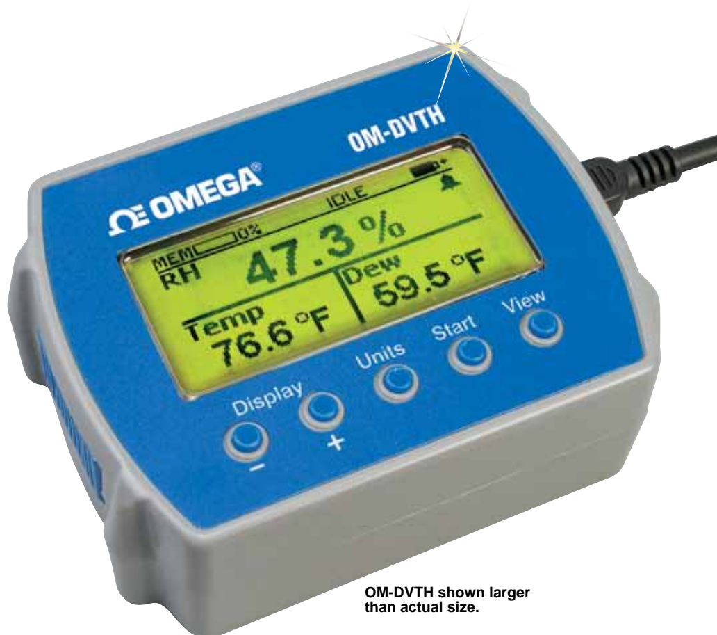
OM-DVTH shown larger than actual size.

The OM-DVTH temperature/relative humidity data logger with display is an easy-to-use, versatile device which can be used for a wide range of logging applications. The OM-DVTH records and instantly displays trends for temperature, humidity and dew point. With the OM-DVTH you can monitor real time measurements for instant environmental conditions. When you're ready, download over 40,000 data points to your PC for further analysis. Data logging has never been this visual.