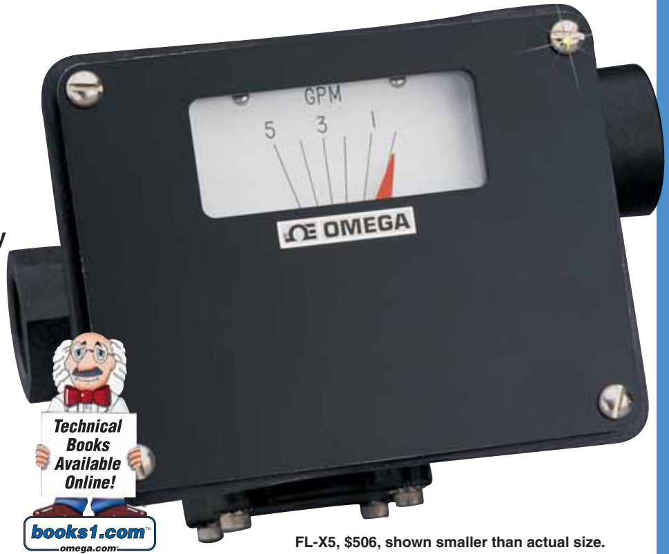
FL-X5, $506, shown smaller than actual size.

FL-X Series variable-area flowrate indicators utilize fluid movement to actuate a swinging vane, which drives the scale pointer and triggers the signal switch. The corrosion-resistant construction includes no breakable tubes, and a display that is unaffected by the opacity of the fluid.