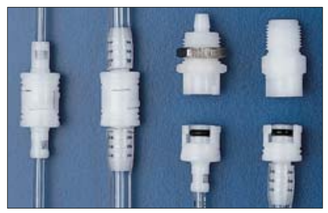
Subminiature couplings offer reliable, repeatable sealing capability for space-constrained applications. Shown here actual size.

OMEGA's FT-SMC coupling is a reliable quick connect system for easy servicing and quick component replacement. Available for in line, panel mount and pipe thread configurations. FT-SMC couplings are a reliable alternative to luer-type connections for medical instruments and devices. Their reliable O-Ring seal makes a leak-free connection every time.