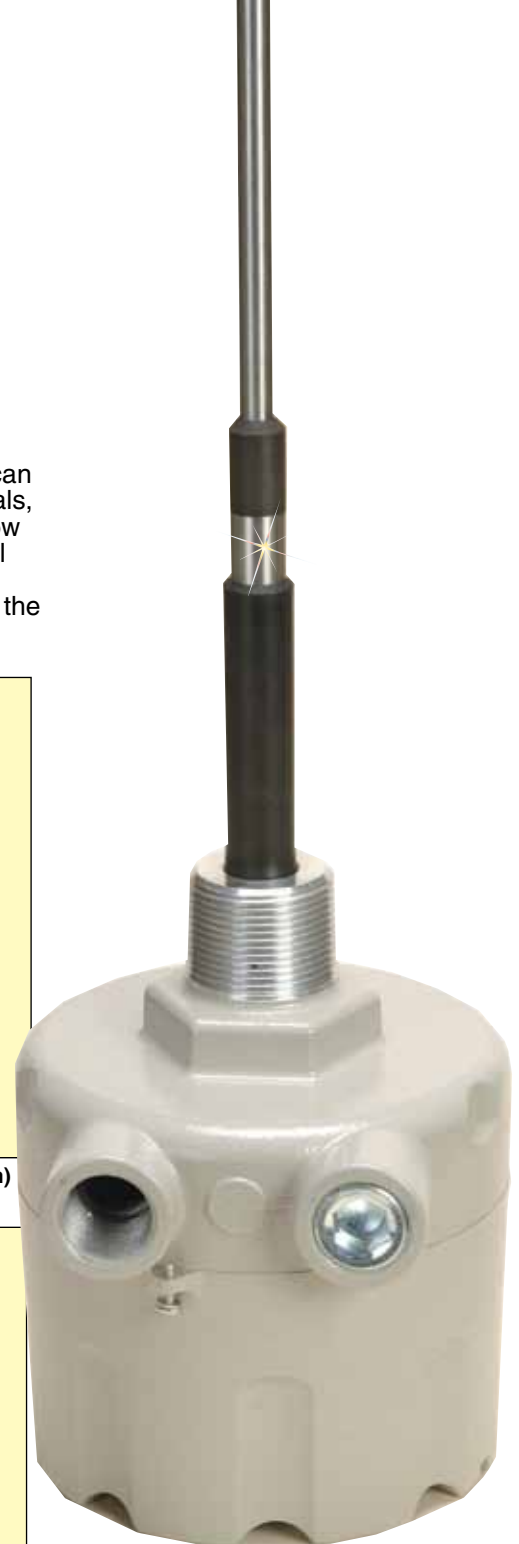
LV801, shown smaller than actual size.