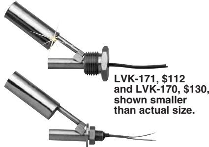
LVK-171, $112 and LVK-170, $130, shown smaller than actual size.