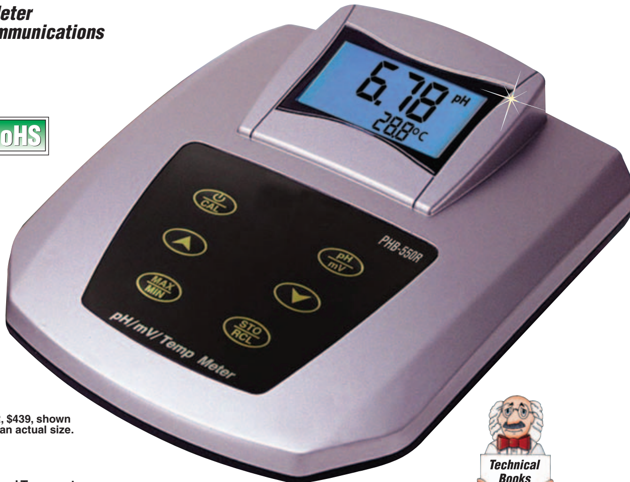
PHB-550R, $439, shown smaller than actual size.