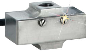
LCM703-250, shown actual size.