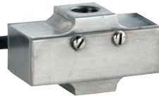
LCM703-10, shown actual size.