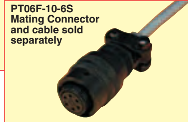
PT06F-10-6S Mating Connector and cable sold separately

Proof Pressure: 150% Range Burst Pressure: The lesser of: 400% Range; or 30,000 psi max Body Material: 17-4 PH Stainless Steel Diaphragm Material: 17-4 PH Stainless Steel