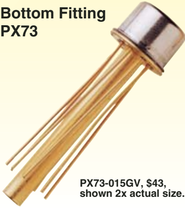
PX73-015GV, $43, shown 2x actual size.