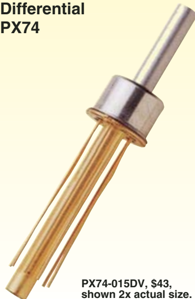
PX74-015DV, $43, shown 2x actual size.