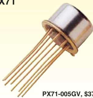
PX71-005GV, $37, shown 2x actual size.