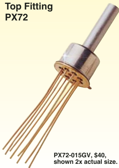
PX72-015GV, $40, shown 2x actual size.

The PX70 Series piezoresistive pressure sensors are packaged in a TO-5 case suitable for PC board mounting. The PX70 is available in full scale ranges from 0.3 to 100 psi as well as 4 standard package options. The PX71, for gage and absolute ranges, is available without fittings, while the PX72 has a top-mounted tube fitting (bottom is vent for gage). The PX73 is also available in gage ranges and has a bottom tube fitting (top is vent). For differential measurements, the PX74 has top and bottom tubes and can be used for unidirectional or bidirectional measurement.