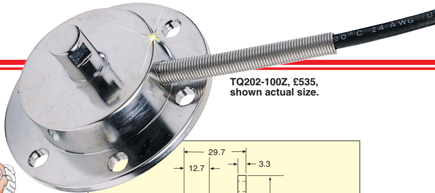
TQM202-100Z, £535, shown actual size.

Output: 2 mV/V Excitation: 10 Vdc, 15V max Input Resistance: 360 Ω min Output Resistance: 350 Ω ±5 Accuracy: ±0.2% FSO (combined linearity, hysteresis and repeatability) Zero Balance: ±2% FSO Compensated Temp Range: 16 to 71°C Operating Temp Range: -54 to 107°C Thermal Effects: Zero: 0.005% FSO/°F Span: 0.005% rdg/°F