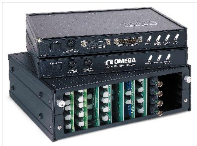
The OMB-DAQBOOK Portable System

There are a number of factors to consider when selecting a front-end system. Begin by analyzing your requirements; do you need only analog inputs, or analog outputs and digital I/O? How many inputs and outputs will you need? Pricing is also a very important factor, in that different systems have different initial costs, with various upgrade/enhancement prices. One major consideration in choosing the right system in the future: if you can anticipate your future needs and requirements, make sure that the system you select either has them now, or can be easily upgraded with them later.