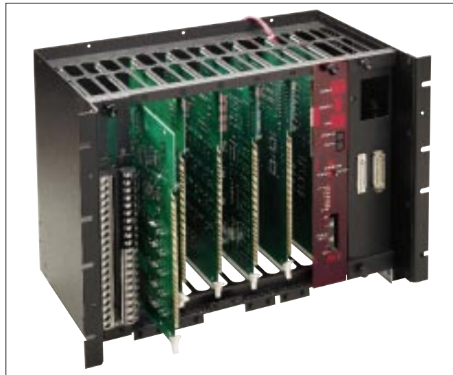
The Workhorse Modular System

capacity for both the program and the data which enables it to perform its functions. The trade-off for these capabilities, however, is price. More enhanced systems, with added features, are more expensive.