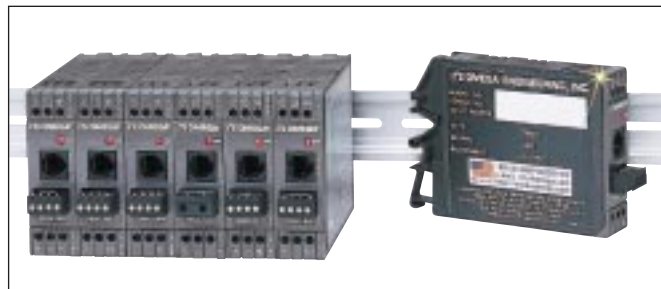
The DRX Series Distributed Modules

capacity for both the program and the data which enables it to perform its functions. The trade-off for these capabilities, however, is price. More enhanced systems, with added features, are more expensive.