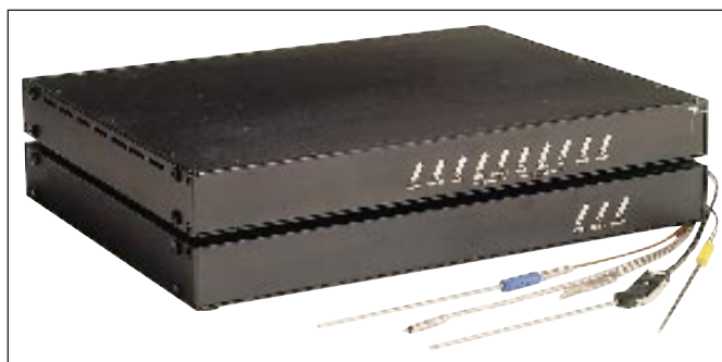
The OMB-TEMPSCAN Temperature Measurement System

Lastly, there are two types of communication-based systems: ones that can stand alone for a period of time, and those that must be in constant communication with a host in order to operate. This difference is profound. Are you willing to dedicate a computer/terminal for communications with the system when it is operational, or do you want the system to perform the acquisition and control without the use of a host, and have the system "dump" the information to the host at a later time, when you can analyze it? A stand-alone system offers you enhanced programmability, and has storage