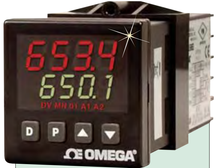
CN63100-R1, $197, shown smaller than actual size.

The CN63100 Series controller accepts signals from a variety of temperature sensors (thermocouple or RTD), precisely displays the process temperature, and provides an accurate output control signal (time proportional or linear DC) to maintain the process at the desired temperature. The controller comprehensive yet simple programming allows it to meet a wide variety of application requirements. The controller operates in the PID control mode for both heating and cooling, with on-demand auto-tune, which will establish the tuning constants. The PID tuning constants may be fine-tuned by the operator at any time and then locked-out from further modification. The controller employs a unique overshoot suppression feature, which allows the quickest response without excessive overshoot. The unit can be transferred to operate in the manual mode, providing the operator with direct control of the output. The controller may also be programmed to operate in the "ON/OFF" control mode with adjustable hysteresis.