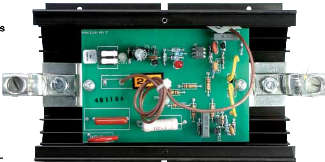
SCR19Z-24-060 shown without fuse shown much smaller than actual size.