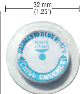
TL-CC-17C, shown actual size.

Ordering Example: TL-CC/5C, 5° low temperature label, package of 10