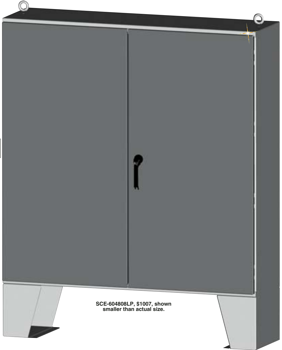
SCE-604808LP, $1007, shown smaller than actual size.