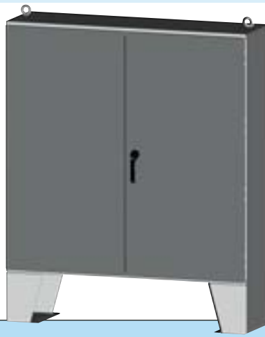
SCE-604808LP, $1007, shown smaller than actual size.