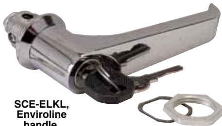
SCE-ELKL, Enviroline handle.