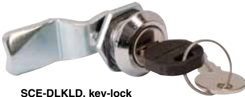
SCE-DLKLD, key-lock door latch.