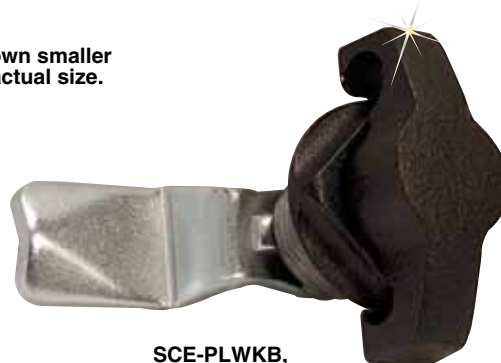
SCE-PLWKB, padlocking wing knob.