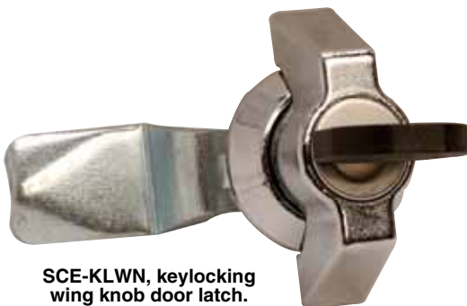
SCE-KLWN, keylocking wing knob door latch.