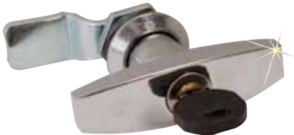
SCE-ELKLH, "T" handle.