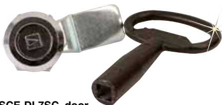
SCE-DL7SC, door latch with key.