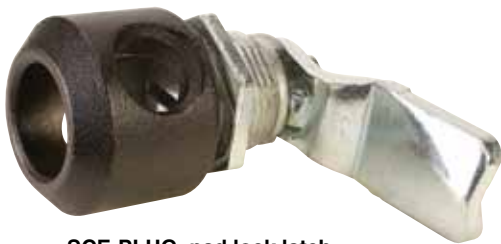
SCE-PLHG, pad lock latch.