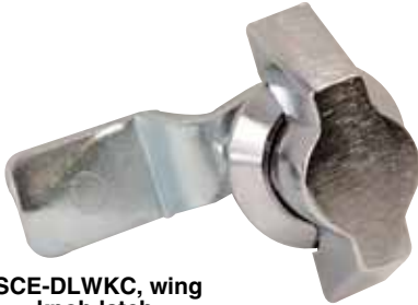
SCE-DLWKC, wing knob latch.