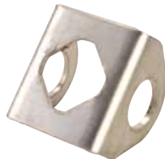
SCE-MINIQL, pad lock latch.