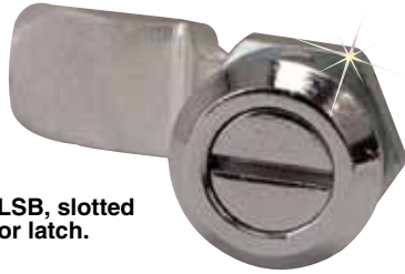
SCE-DLSB, slotted door latch.