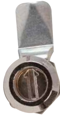
SCE-DLCA, coin proof door latch.