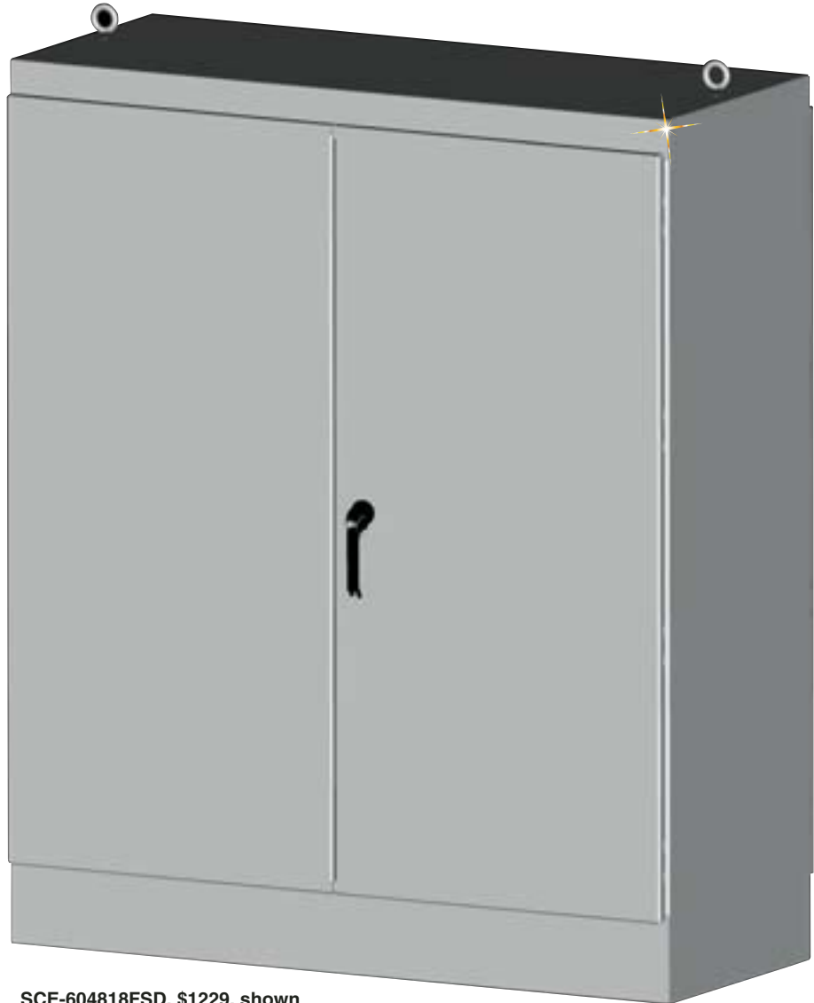
SCE-604818FSD, $1229, shown smaller than actual size.