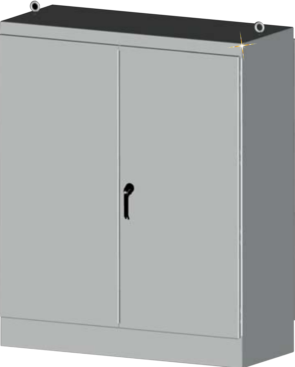
SCE-724824FSDAD, $2551, shown smaller than actual size.