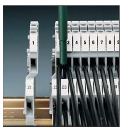
Upper level is offset from lower level to facilitate the termination.