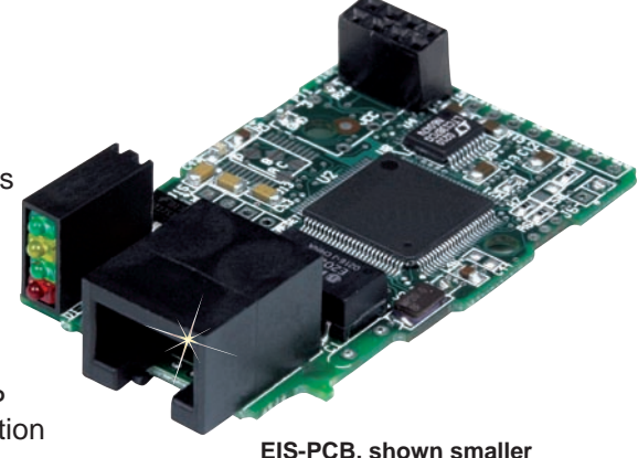
EIS-PCB, shown smaller than actual size.

For example, an electric power meter could serve a Web page that displays whatever data is available from the meter such as current