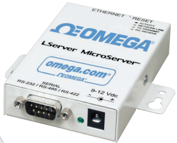
EIS-W, £131, shown smaller than actual size.