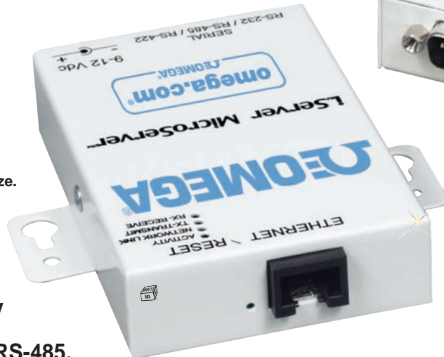
EIS-W, £131, shown smaller than actual size.