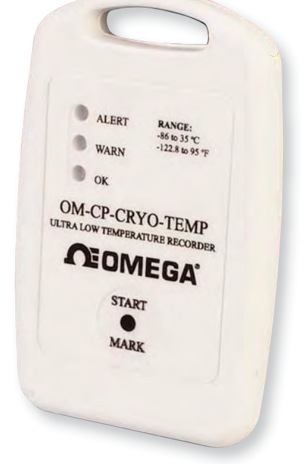
OM-CP-CRYO-TEMP, $199. shown actual size.