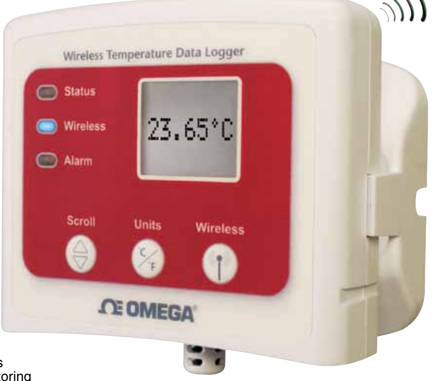
OM-CP-RFTEMP2000A with mounting bracket shown actual size.