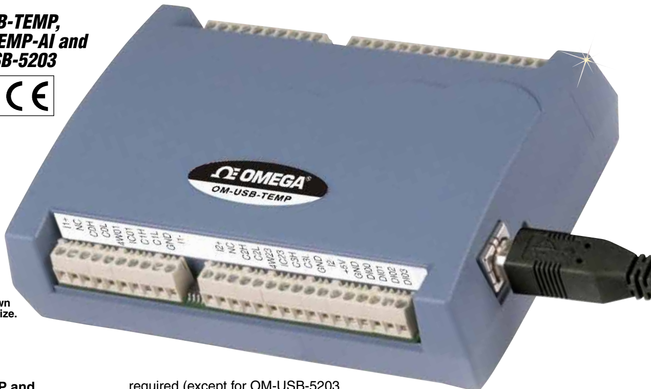
OM-USB-TEMP, shown smaller than actual size.