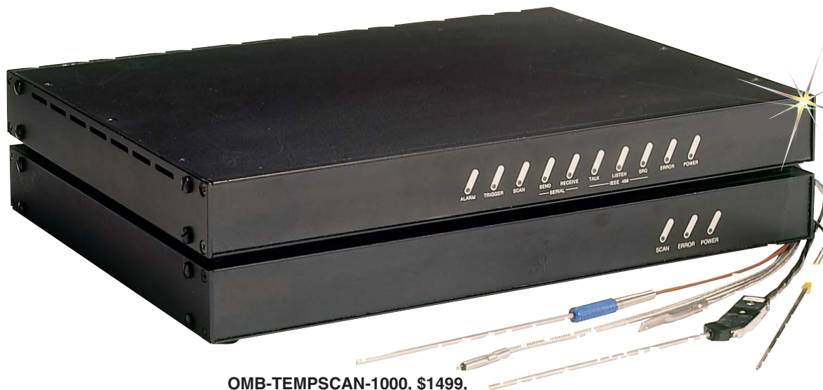
OMB-TEMPSCAN-1000, $1499, shown smaller than actual size