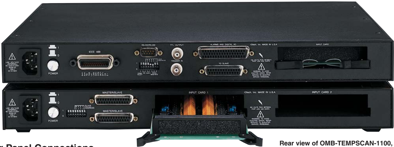
Rear view of OMB-TEMPSCAN-1100, $1499 and OMB-EXP-10A, $799