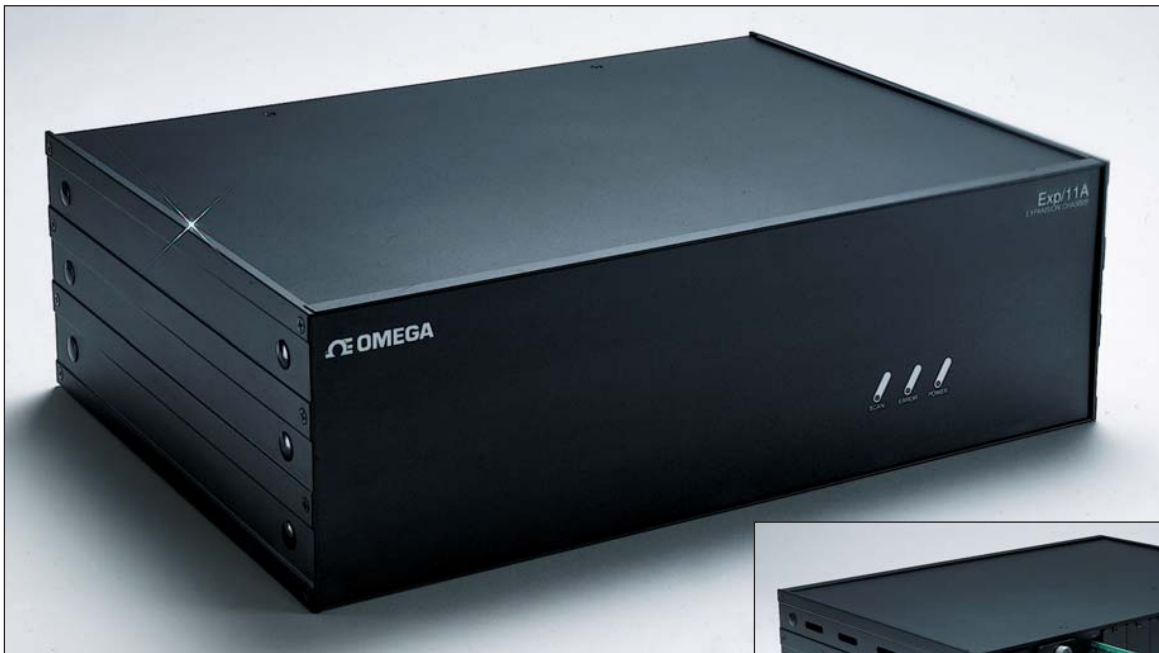
OMB-EXP-11A Optional Expansion Chassis, $1999