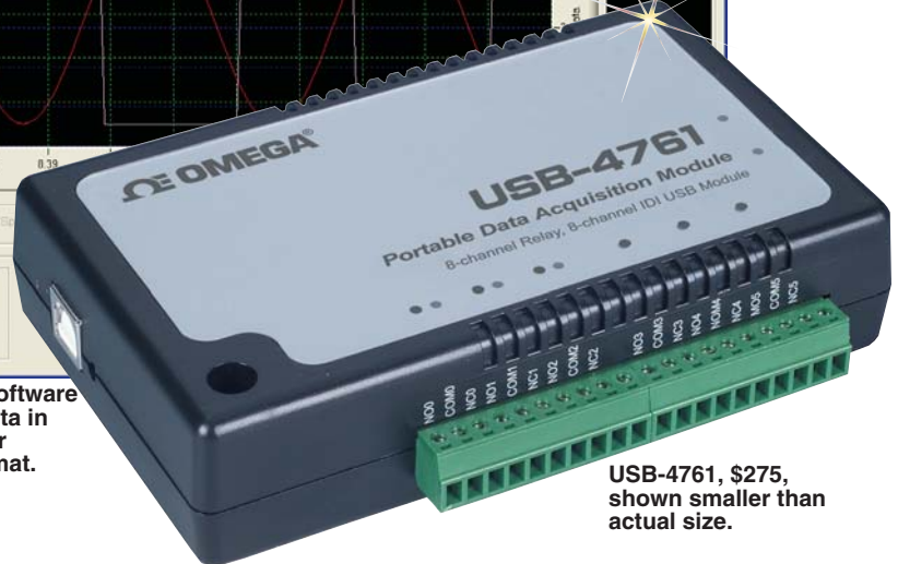
USB-4761, $275, shown smaller than actual size.

system from any incidental harms. If connected to an external input source with surge-protection, the USB-4761 can offer up to a maximum of 2000 Vdc ESD (Electrostatic Discharge) protection.