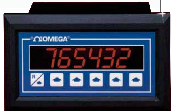
DPF66, £281, shown smaller than actual size. See page M-19 for details.

integral part of the sensor. The FD-5000 sensor is utilised on pipes that range in internal diameter from 25.4 to 508 mm (1 to 20").