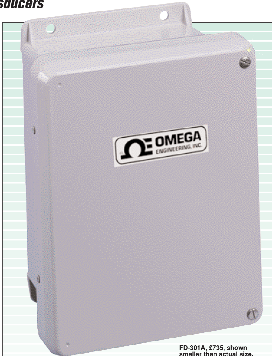
FD-301A, £735, shown smaller than actual size.

The encapsulated, submersible, design of the transducer sensor head can be easily mounted to the pipe surface with the coupling compound and clamp supplied with the unit. A 6 m (20') cable for connection to the transmitter/indicator unit is supplied as an