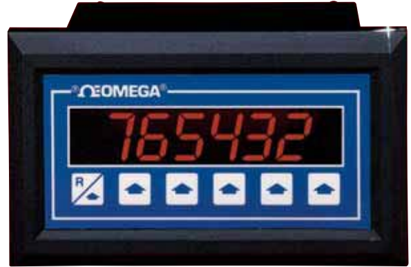
DPF66, $281, shown smaller than actual size. See page M-19 for details.