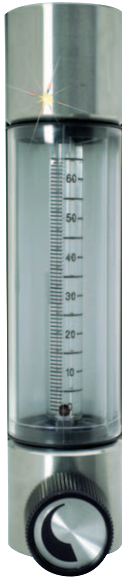
FL-5411G Series flowmeter, $234, basic model, shown actual size.