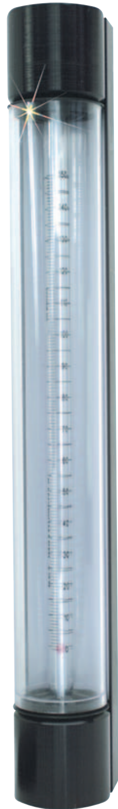
FL-5511G-NV Series flowmeter, aluminum, $136, basic model, shown smaller than actual size.