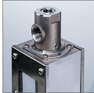
316 SS Rotatable Fittings

Accuracy: ±2% FS Repeatability: ±0.5% Scale: 250 mm (10") Scale Plate and Shield: Polycarbonate Wetted Parts: 316L SS, EPR O-rings, borosilicate glass Max Temp: 93°C (200°F) Turndown: 10:1