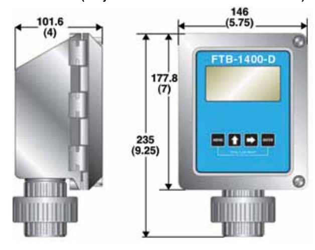
Dimensions: mm (inch)