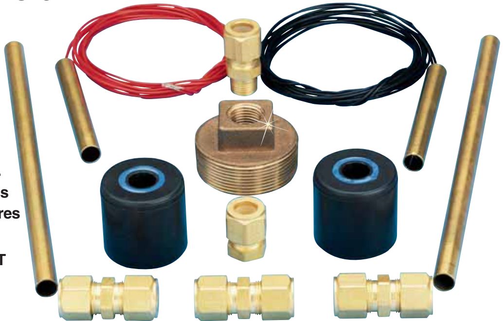
LV-120 (complete drum indicator kit), $297, shown smaller than actual size.

The LV-120 Series OMEGA LEVEL™ custom switch kits can be assembled and installed vertically in your tank in minutes. Each kit contains all the components for complete assembly of a 1- or 2-station level switch for pipe-plug mounting. Additional level stations may be added (see accessories).