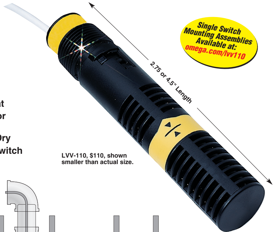
LVV-110, $110, shown smaller than actual size.

Accuracy: ±2 mm in water Repeatability: ±1 mm in water Extreme Orientation: ±20° from vertical Specific Gravity: 0.8 min. Switch Type: For LVV-110, 111; SPDT for LVV-120, 121 Switch Voltage: 120 Vac, 120 Vdc @ 15 VA for LVV-110, 111; @ 50 VA for LVV-120, 121 Switch Output: Selectable NO or NC States Temperature Range: -40 to 90°C (-40 to 194°F) Pressure Range: 25 psi (2 bar) @ 25°C; derated @ 1.667 psi (0.113 bar) per °C above 25°C Probe Material: PP or PVDF Probe Rating: NEMA 6 (IP68) Mounting Threads: ¾ NPT Cable Type: 2.4 m (8'), 3-wire, 22 gauge with ground, shield and PP or PFA jacket Max. Cable Length: Up to 152 m (500') Dimensions: 13.7 x 2.67 or 8.1 x 2.67 cm (5.4 x 1.05 or 3.2 x 1.05"), ¾ NPT