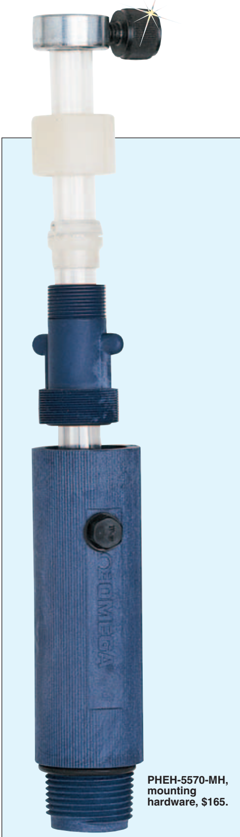
PHEH-5570-MH, mounting hardware, $165.