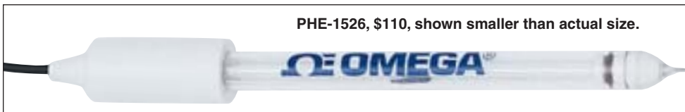
PHE-1526, $110, shown smaller than actual size.

The PHE-1525 flat style is a refillable combination pH electrode with a polymer body, porous PTFE liquid, and a flat pH glass membrane. It can be used to measure the pH of any moist surface or inverted and used as a "one-drop" electrode. Samples as small as 100 µL are easily measured with this inverted technique.