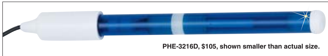
PHE-3216D, $105, shown smaller than actual size.

Laboratory procedures require a separate reference electrode. Several standard methods and techniques for pH measurement and most ion selective electrodes require the use of a "double junction" reference electrode. The PHE-3216 is ideal for such applications. These gel-filled electrodes feature a replaceable porous PTFE liquid junction in a polymer body. They are supplied ready to use with a saturated potassium chloride-silver reference cell. The double junction version uses potassium nitrate as the screening electrolyte, although it can be easily replaced with the electrolyte of your choice. The liquid junction has a large surface area and provides a stable, low-impedance contact to the solution, ensuring fast, accurate measurements. The chemically inert nature of PTFE makes the sensor easy to clean.