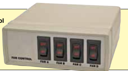
TVS-1008 fan control box, shown smaller than actual size

The chamber can accommodate up to 6 PCBs with 13 mm (0.5") card-to-card spacing or 3 PCBs with 25 mm (1") card-to-card spacing.