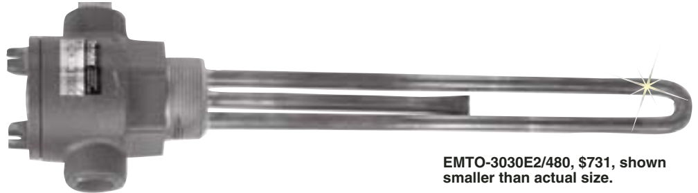
EMTO-3030E2/480, $731, shown smaller than actual size.