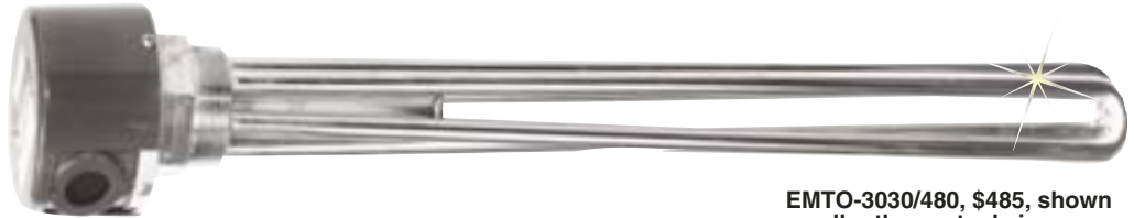
EMTO-3030/480, $485, shown smaller than actual size.

NEMA 1 (IP00) rated, or type E2 moisture-resistant/explosion-resistant enclosure. 2