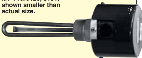
MT-1 Series General Purpose Enclosure 1

MT-110A/120, $151, shown smaller than actual size.