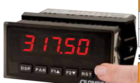
DP63800-E, shown smaller than actual size.