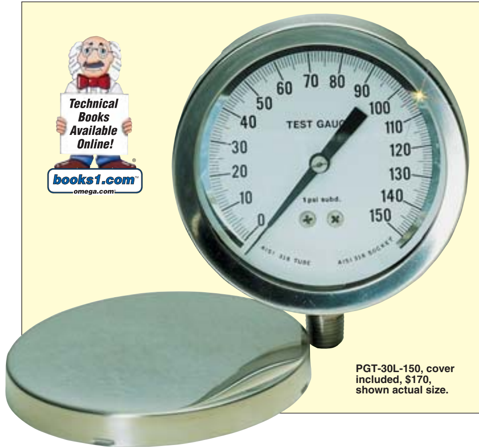
PGT-30L-150, cover included, $170, shown actual size.

Accuracy: 0.5% FS Case: Polished stainless steel Dial: White background with mirrored band Pointer: Adjustable with knife-edge tip Movement: Stainless steel Element: 316 SS Connection: ¼ NPT