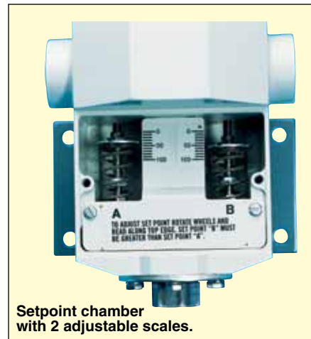
Setpoint chamber with 2 adjustable scales.