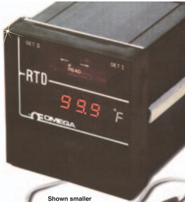
Shown smaller than actual size

The OMEGA® 4200A Series is an ideal controller for RTD applications. This quality-built linearized instrument is available in both 1.0° and 0.1° resolution models. Higher accuracies, accuracies 5 to 10 times greater than the typical 1% meter indicating controller, are achieved through a unique linearizing technique.