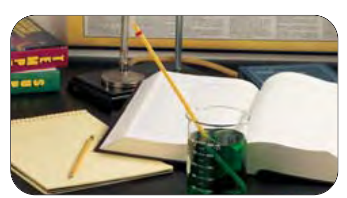
Available with red safety liquid, in a variety of ranges and styles.

Economical glass-bulb thermometers are ideal for school and laboratory applications. These general-purpose, easy-to-read white back units are available with red liquid filling, in a variety of ranges and styles.