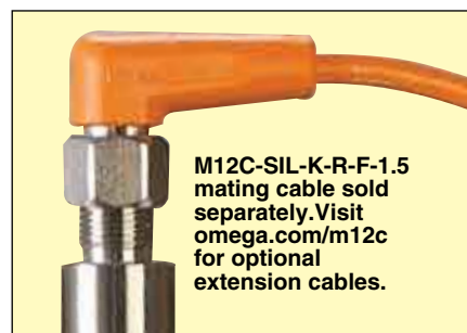
M12C-SIL-K-R-F-1.5 mating cable sold separately. Visit omega.com/m12c for optional extension cables.

Thermowell sold separately. Visit omega.com/260_commodity for details.