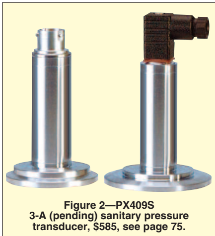
Figure 2—PX409S 3-A (pending) sanitary pressure transducer, $585, see page 75.

applications. Construction is all stainless steel with an electro-polished finish. This unit is designed for clean-in-place operation. This sensor utilizes thin-film technology which is known for reliability and accuracy. It is calibrated to NIST standards. The low response time of 5 msec ensures tight process control. The reading is delivered via a 1 to 5 Vdc output signal or a 4 to 20 mA current loop.