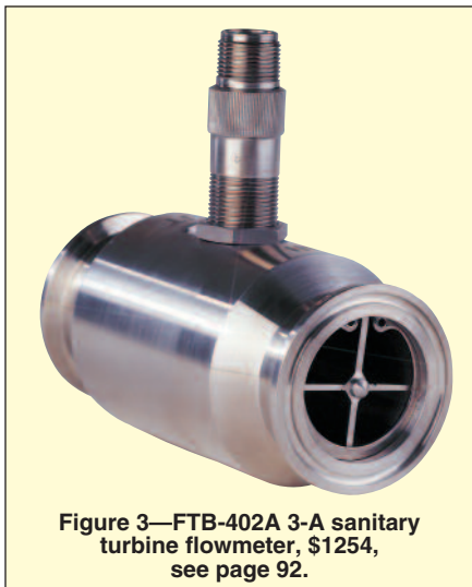
Figure 3—FTB-402A 3-A sanitary turbine flowmeter, $1254, see page 92.

Sanitary turbine flowmeters, such as the unit shown in Figure 3, are used in processing liquids and beverages. They are also found in applications requiring pasteurization and can be used for thicker materials such as ketchup and chocolate. Units are available in sizes ranging from ¼ to 3" in diameter. This type of sensor covers flow ranges from a fraction of a gallon per minute (GPM) up to hundreds of GPM. The design of the flowmeter and materials of construction are suitable for cleaning in place (CIP).