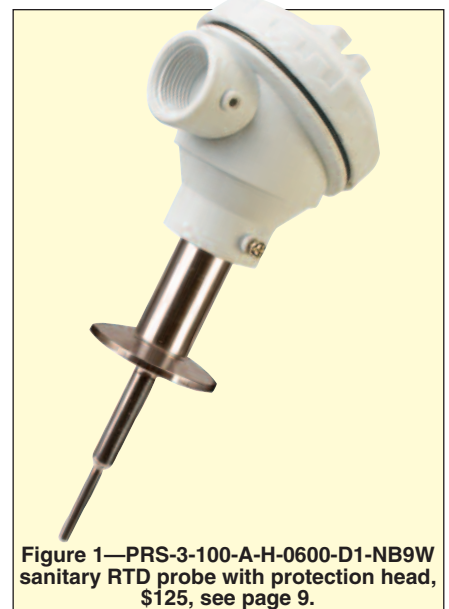
Figure 1—PRS-3-100-A-H-0600-D1-NB9W sanitary RTD probe with protection head, $125, see page 9.

Figure 2 shows a 3-A (pending) sanitary pressure transducer. This device is typically used in dairy, food processing, pharmaceutical, and biotech