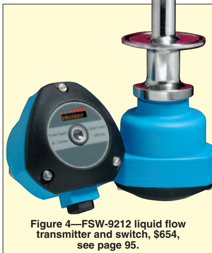
Figure 4—FSW-9212 liquid flow transmitter and switch, $654, see page 95.

The Model FSW-9000 transmitter/switch shown in Figure 4 monitors the flow velocity of the product based on the principle of thermal dispersion between heated and unheated RTDs immersed in the product. It generates an analog output signal corresponding to the flow rate and includes a set point feature which can signal a process controller or operator when a specified flow is achieved. If an actual flow measurement is not required, a simpler flow switch can be used to signal when the flow rate set point is reached.